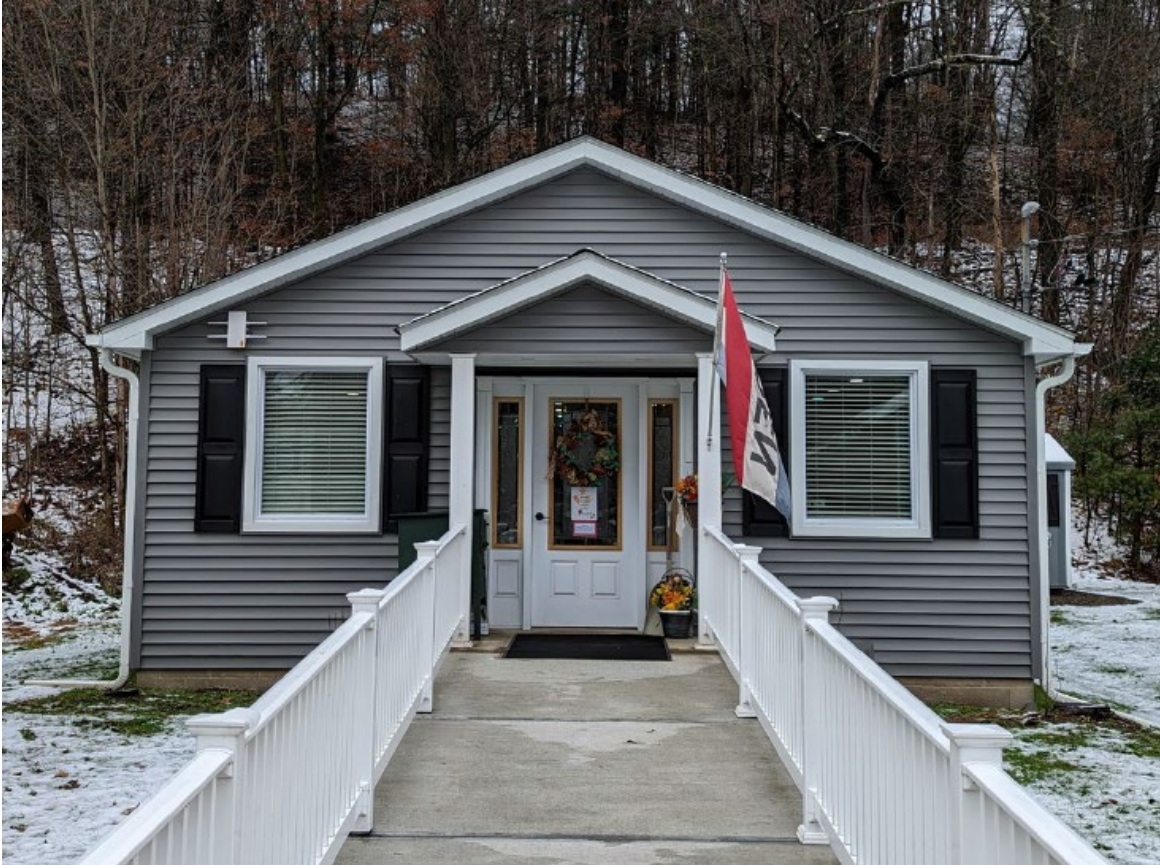
Nineveh Public Library in Broome County New roof, siding, and windows for increased energy efficiency.

The University of the State of New York THE STATE EDUCATION DEPARTMENT The Office of Cultural Education New York State Library Albany, New York 12230 www.nysl.nysed.gov