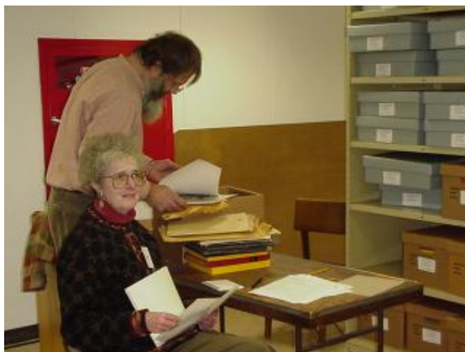
Appraisers examining a collection

Some gifts made to non-profit agencies, including libraries, may be tax deductible. The first step in finding out if your donation qualifies you for a deduction, is to contact an accountant or tax professional. Then, you will need to obtain a professional appraisal of your donated papers to establish their “fair market value.” The State Library can provide a list of fee-based, independent appraisers in the Capital Region.