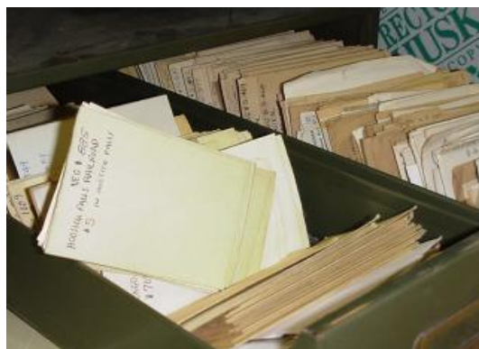
Photo negatives as originally received in plain paper envelopes and old metal file drawers

When your collection arrives in the Library one of the first steps in “processing” is re-housing the contents in protective boxes, folders and enclosures. These are made of special chemically inert materials, which will help keep unstable media from deterioration.