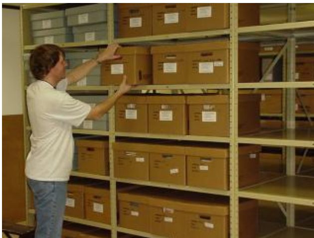
Storing the re-boxed and carefully labeled documents

Once the collection is re-housed it is stored in specially-constructed shelving in our climate-controlled storage area.