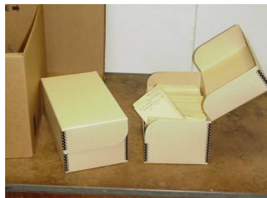
Negatives re-housed in “safe” archival folders and boxes