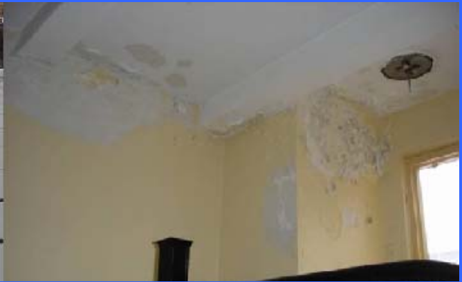
↑ Leaking & Water Damaged Roofs Compromising the Integrity of the Structure ↑