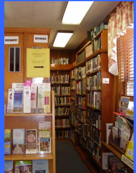
Library buildings are cramped and outdated