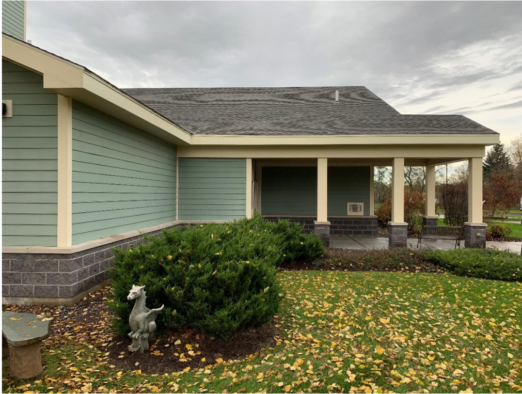
Waterville Public Library in Oneida County Roof Edge and Fascia Replacement