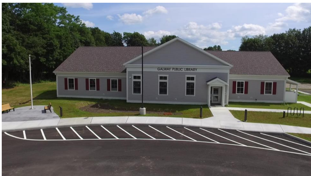
New Galway Public Library in Saratoga County

The University of the State of New York THE STATE EDUCATION DEPARTMENT The Office of Cultural Education New York State Library Albany, New York 12230 www.nysl.nysed.gov