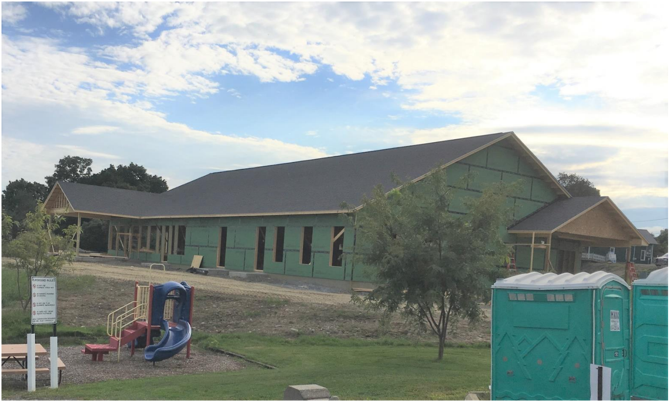
New Pulteney Free Library in Steuben County