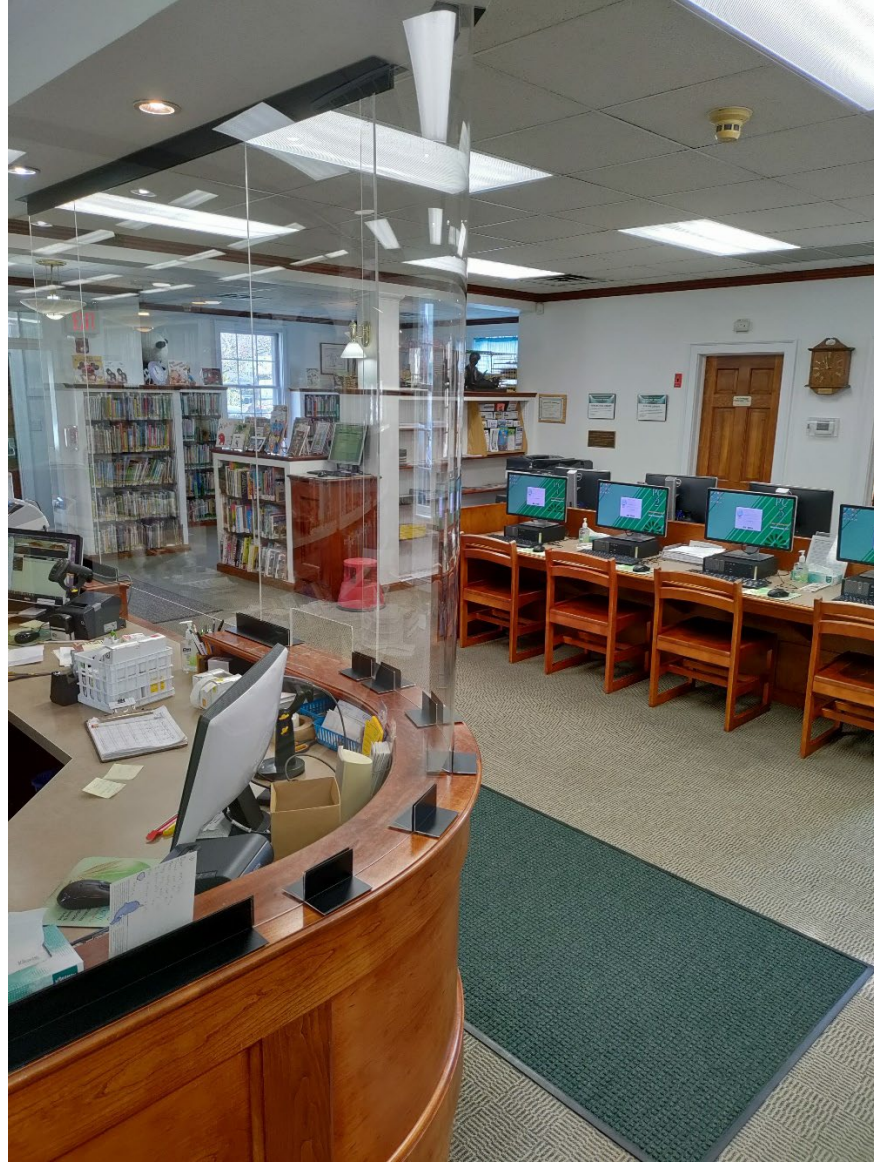
Pawling Free Library in Dutchess County Alteration of library spaces to improve accessibility.