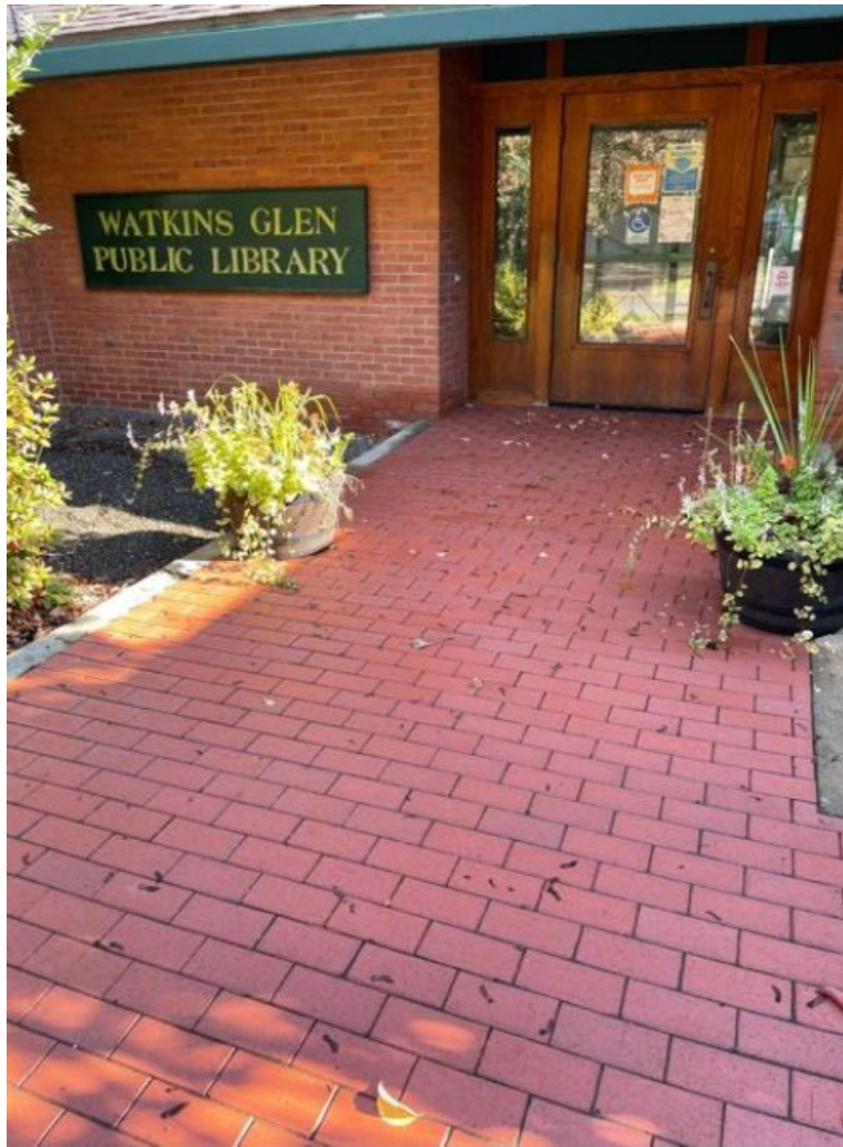
Watkins Glen Public Library in Schuyler County, New York. Improved accessibility project that features ADA compliant sidewalk entryways.

The State Education Department recommends that the provisions of Chapter 498 be made permanent in statute.