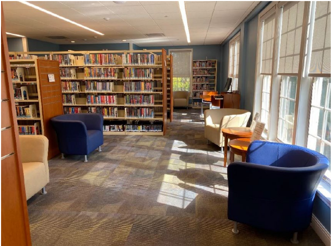
Lagrange Association Library, Dutchess County, New York. New Main Library Adult Space