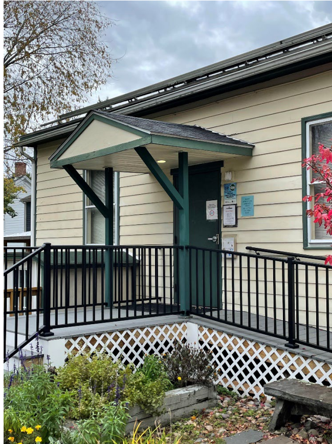
Nassau Free Library in Rensselaer County New ADA compliant ramp and deck.

The University of the State Of New York THE STATE EDUCATION DEPARTMENT The Office of Cultural Education New York State Library Albany, New York 12230 www.nysl.nysed.gov