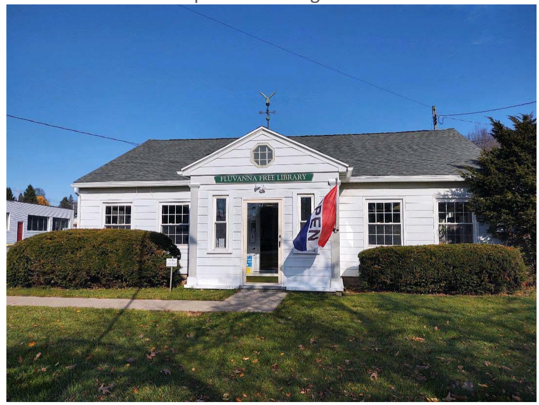
Fluvanna Free Library in Chautauqua County New roof

The University of the State Of New York THE STATE EDUCATION DEPARTMENT The Office of Cultural Education New York State Library Albany, New York 12230 www.nysl.nysed.gov