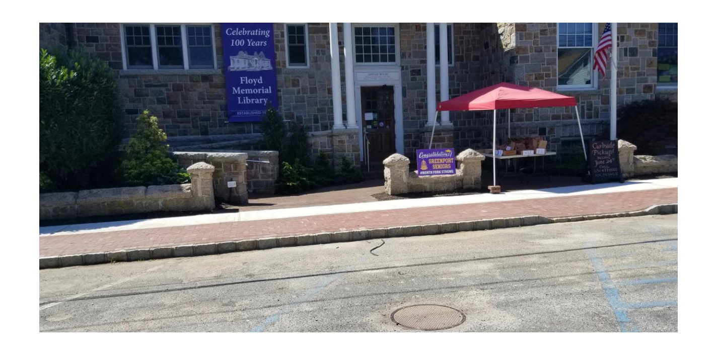
Floyd Memorial Library in Suffolk County Pavement and curbing replacement